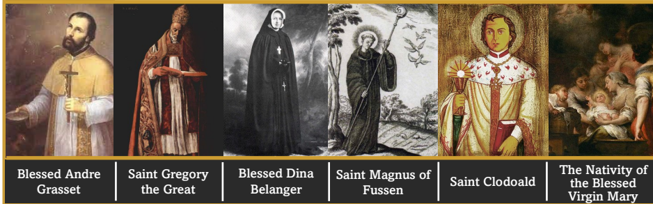
Blessed Andre Grasset | Saint Gregory the Great | Blessed Dina Belanger | Saint Magnus of Fussen | Saint Clodoald | The Nativity of the Blessed Virgin Mary

08 The Nativity of the Blessed Virgin Mary