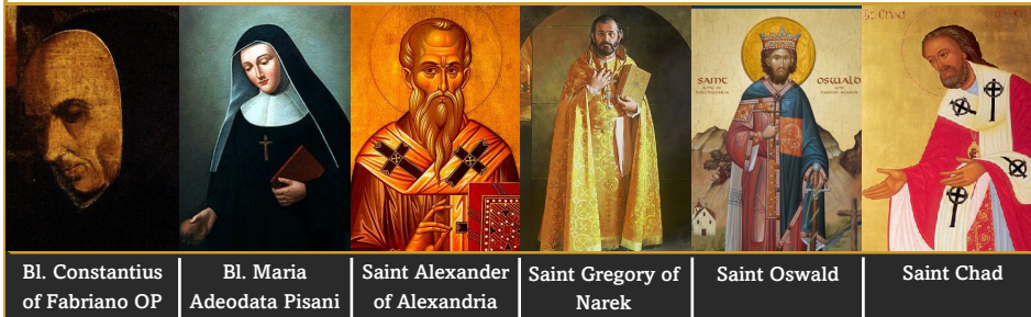
Bl. Constantius of Fabriano OP Bl. Maria Adeodata Pisani Saint Alexander of Alexandria Saint Gregory of Narek Saint Oswald Saint Chad