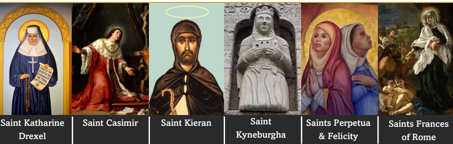
Saint Katharine Drexel | Saint Casimir | Saint Kieran | Saint Kyneburgha | Saints Perpetua & Felicity | Saints Frances of Rome