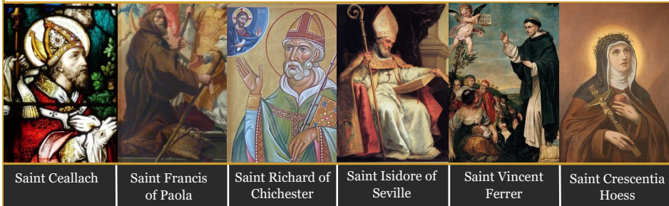
Saint Ceallach Saint Francis of Paola Saint Richard of Chichester Saint Isidore of Seville Saint Vincent Ferrer Saint Crescentia Hoess