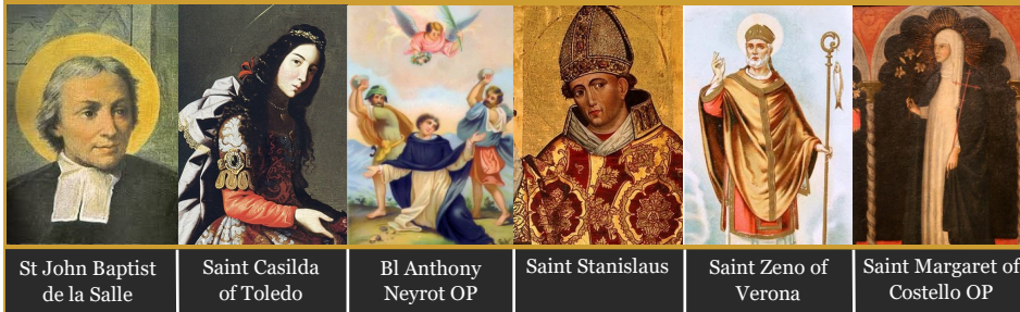
St John Baptist de la Salle

13 Saint Margaret of Castello OP (1287 - 1320)