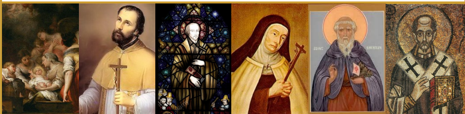
Nativity of the Bl Virgin Mary