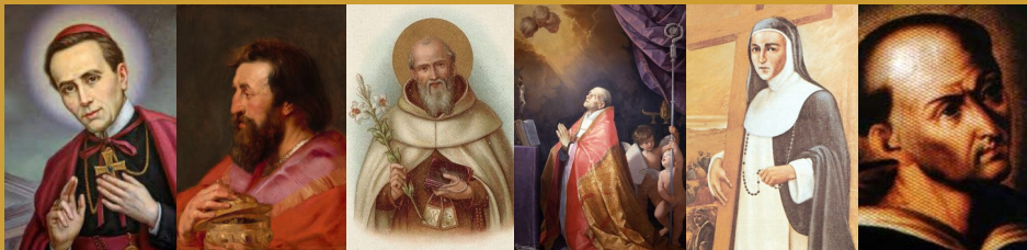
Saint John Neumann