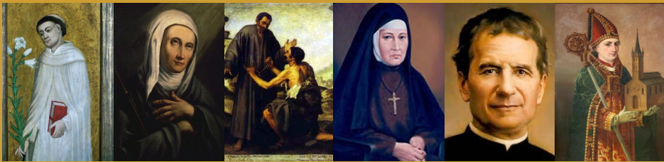
St Robert of Molesme