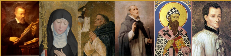
St Jerome Emiliani