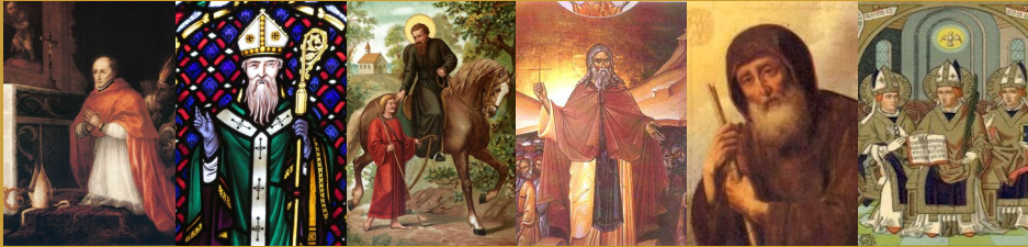
St Turibius of Mongrovejo