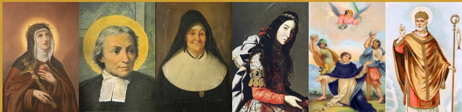
St Crescentia Hoess