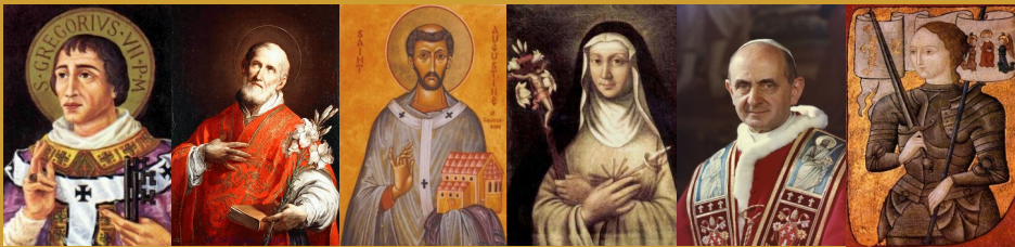
St Gregory VII